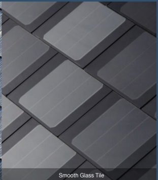
Smooth Glass Tile