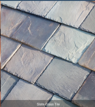
Slate Glass Tile