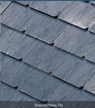
Textured Glass Tile